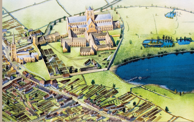
Medieval Much Wenlock

The Shropshire Archaeological and Historical Society, registered charity no. 511564, was formed in 1877. In 1923 it amalgamated with the Shropshire Parish Register Society. We campaign for the recording and protection of Shropshire's rich and varied archaeological heritage. We also promote and publish original research into the county's exciting history and prehistory.