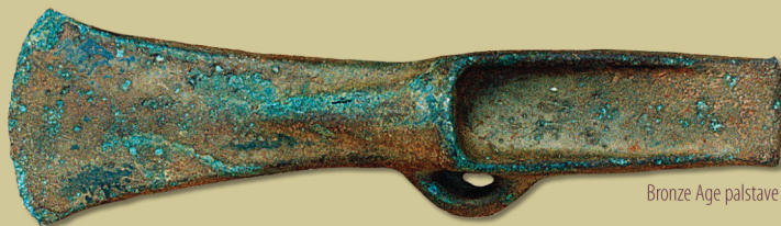
Bronze Age palstave

The Society organizes a rich and varied programme of events throughout the year. These include guided walks and visits to historic sites in the summer months, a programme of talks throughout the autumn and winter, occasional day-schools, and an annual lecture.