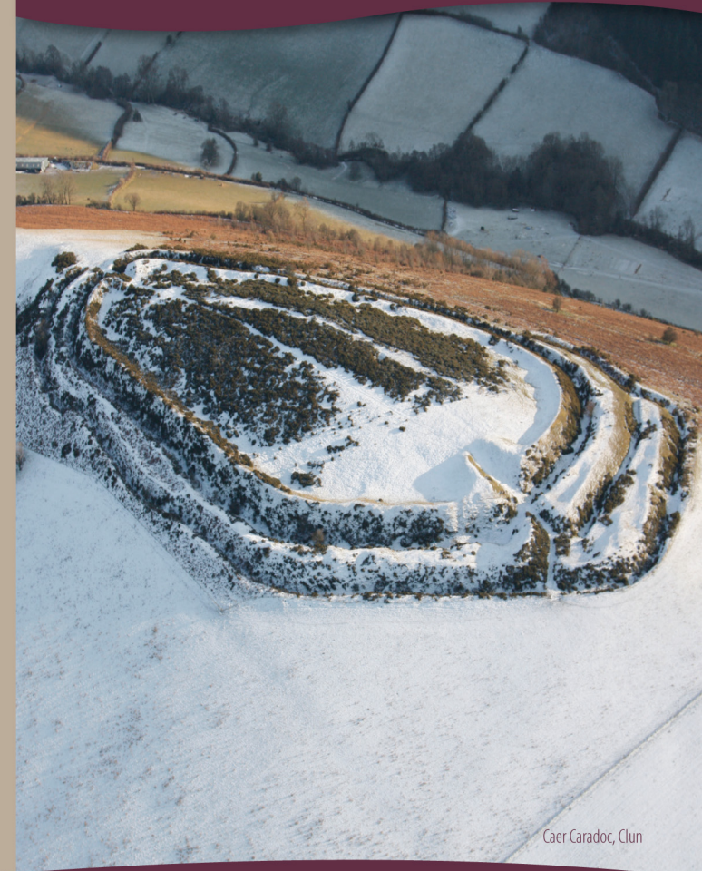
Caer Caradoc, Clun

SHROPSHIRE Archaeological and Historical Society