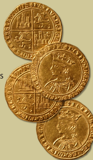
Gold nobles from Myddle